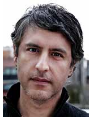
Reza Aslan, non-fiction, international bestselling author of Zealot: The Life & Times of Jesus of Nazareth, No God But God, and How to Win A Cosmic War.